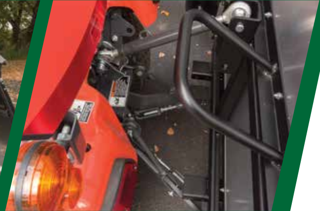
Fits Any Category 1 Three-Point Hitch