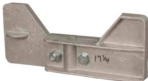
2-Blade Impeller Engines with \frac{3}{4} " Shafts A0124