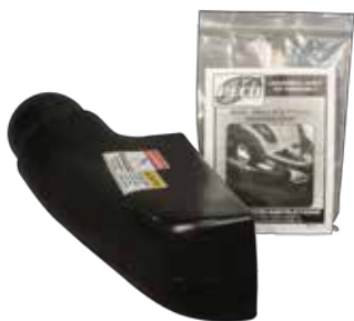
Small Universal Boot Kit A0121