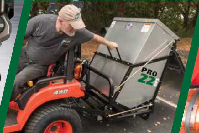
Huge 22 Cubic Foot Capacity Box Dumps From Seat