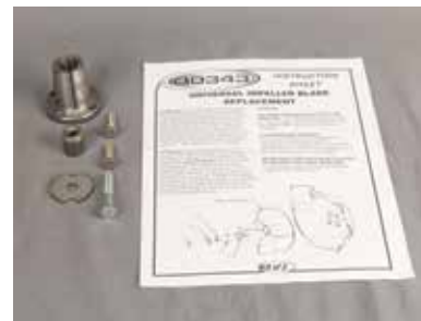
Tapered Bushing Kit Engines with \frac{3}{4} " Shafts A0046