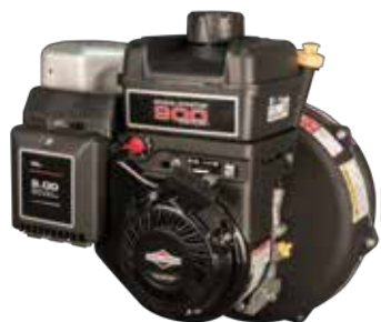
Briggs & Stratton 900 Series Gas Engine with Blower & Blade A602

PECO baggers are designed to last, with many customers getting a decade or more of use from their units. To support the continued use of our product, PECO maintains an extensive inventory of replacement parts. Our experienced staff can assist you with parts look-up.