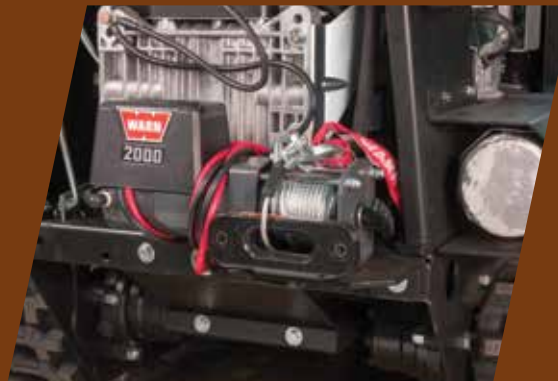
Warn Winch Comes Standard