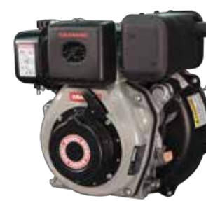
Yanmar Diesel Engine with Blower & Blade A620