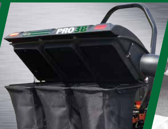
Rugged Linear Low Density Polyethylene Top with 3 Bags