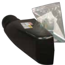
Large Universal Boot Kit A0137