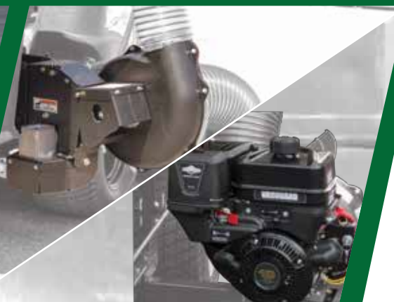
Available with PTO or Engine Drive