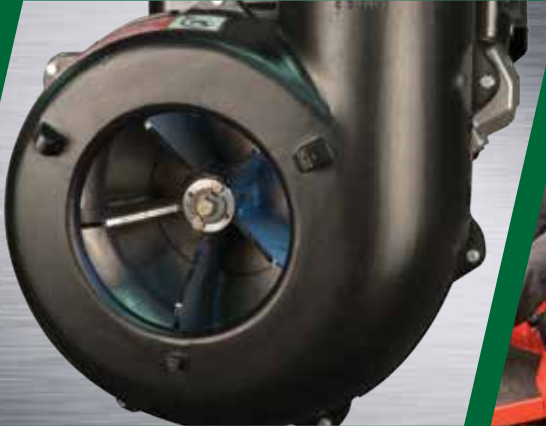
5-Blade Impeller and Large Aluminum Housing

The PRO22 DFS is a unique solution for compact tractors. It is a fully mounted universal collection system that is great for any 2 or 4-wheel drive utility tractor with a category 1 three-point hitch. The aluminum box and cast aluminum components are lightweight and durable. Its huge 22 cubic foot capacity fits decks up to 72". Powered by a gas or optional diesel engine, this is the perfect complement to your tractor.