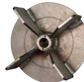
4-Blade Impeller A0645