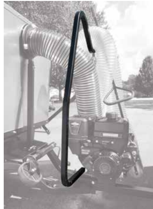
Utility Vehicle Hose Hanger