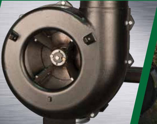
4-Blade Steel Impeller and Cast Aluminum Housing

The PECO CONVERTIBLE X20 & X30 are rugged, lightweight vacuum systems that fit practically any lawn tractor or zero-turn mower. Both are the perfect solution for residential or light commercial use. Their tapered beds allow easy dumping and both quickly convert to dump carts for year round versatility. Both are built for year after year of reliable clean ups.