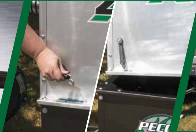
Converts to a Dump Cart in Minutes