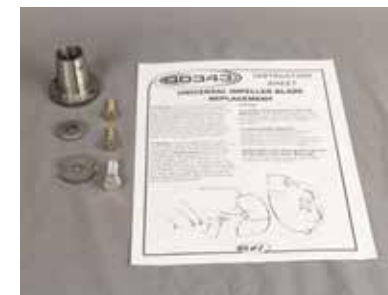
Tapered Bushing Kit Large Housing Engines with 1" Shafts A0069