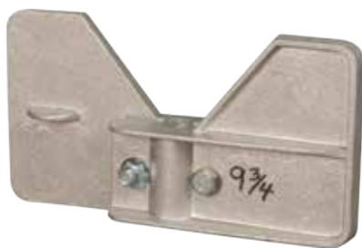
2-Blade Impeller PTO's with \frac{3}{4} " Shafts A0012