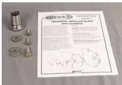
Tapered Bushing Kit Small Housing Engines & PTOs with 1" Shafts A0014