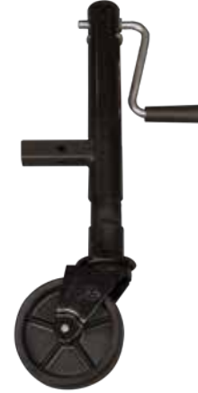
Jack Stand With Wheel