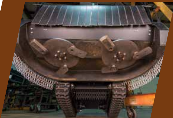
Massive Cutting Blades