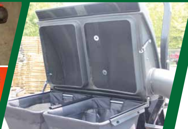
Rugged Linear Low Density Polyethylene Top with 2 Bags