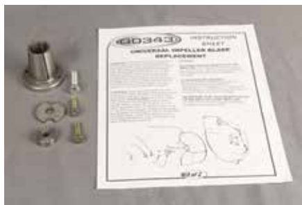
Tapered Bushing Kit Engines with \frac{7}{8} " Shafts A0008