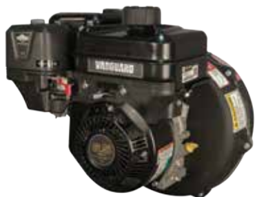
Briggs & Stratton 6.5hp Vanguard Gas Engine with Blower & Blade A639

PECO baggers are designed to last, with many customers getting a decade or more of use from their units. To support the continued use of our product, PECO maintains an extensive inventory of replacement parts. Our experienced staff can assist you with parts look-up.