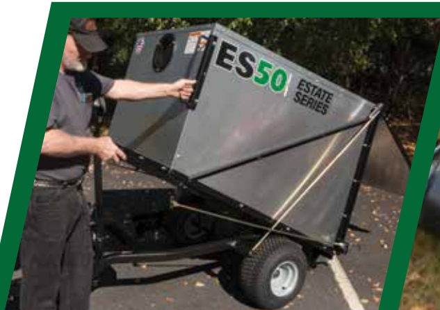
Easy Dump Action

Even with their huge capacity, the 36 & 50 ESTATE SERIES have the convenience of a compact trailer system. Both commercial grade models are equipped with the Trail-o-Matic hitch, which eliminates stretching or dragging the hose. These models are designed to fit most garden and compact tractors with mower decks up to 72". The tapered aluminum box provides easy dumping with a quick lever pull.