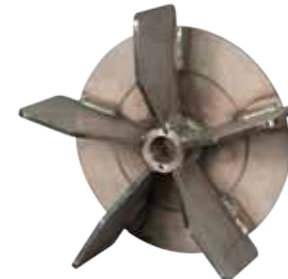
5-Blade Impeller A0644