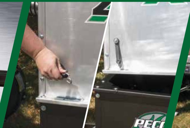
Converts to a Dump Cart in Minutes