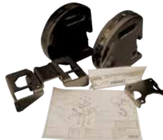
Universal Weight Kit