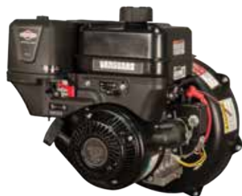
Briggs & Stratton 10hp Vanguard Electric Start Gas Engine with Blower & Blade A615