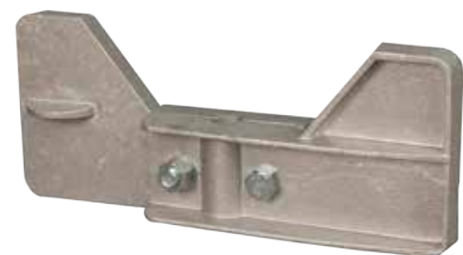
2-Blade Impeller Engines with \frac{3}{4} " Shafts A0124