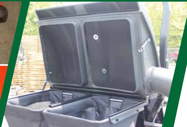
Rugged Linear Low Density Polyethylene Top with 2 Bags