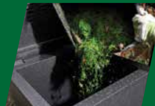
Food for Your Composter