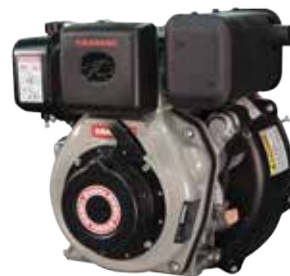
Yanmar 7hp Electric Start Diesel Engine with Blower & Blade A620