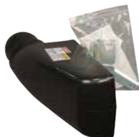
Large Universal Boot Kit A0137