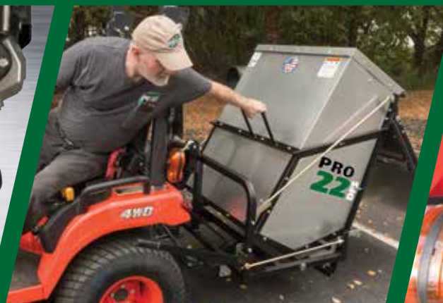
Huge 22 Cubic Foot Capacity Box Dumps From Seat