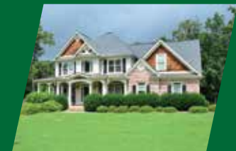
A Vacuumed Lawn is a Beautiful Lawn