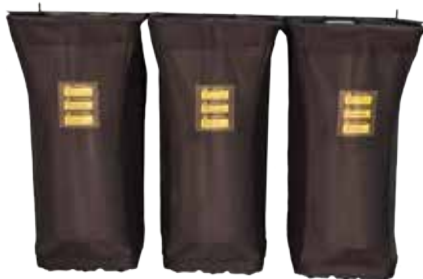
Fabric Collection Bags with Hard Plastic Bottom