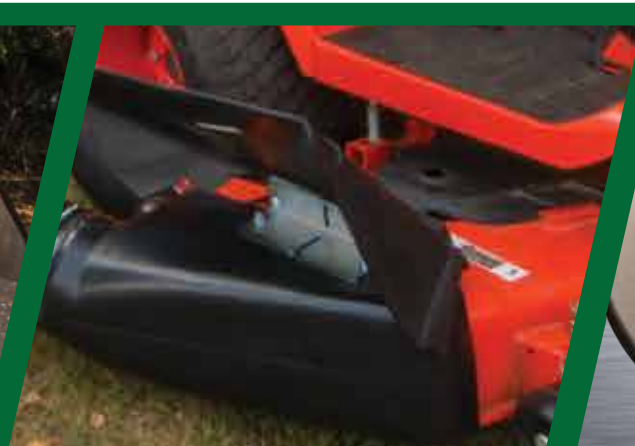
Heavy-Duty Polyethylene Universal Boot