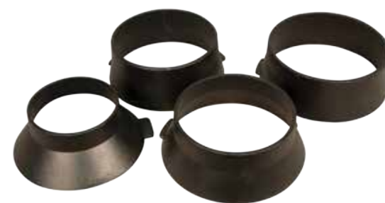
Blower Cones 6" - 9"