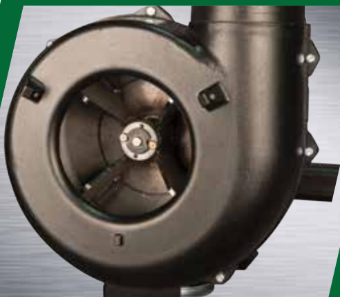
4-Blade Steel Impeller and Cast Aluminum Housing

Designed with the professional landscape contractor in mind, the PRO3B is a true commercial collection system. The tapered design of the bags makes them easy to remove and dump. The Pro 3B features a rugged design and our patented mid-mount blower system to provide the high volume collection capacity that today's commercial ZTR mowers demand.