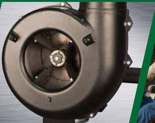
4-Blade Steel Impeller and Cast Aluminum Housing

The PRO12 DFS (Dump From Seat) is a mounted aluminum box designed for lightweight and obstruction free dumping from the operator's seat. The Pro 12 DFS will increase your productivity, whatever your application. Featuring our patented mid-mounted blower, it has the power to handle today's high output commercial decks.