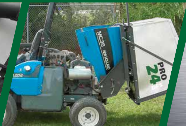
Access Engine Compartment to Mower