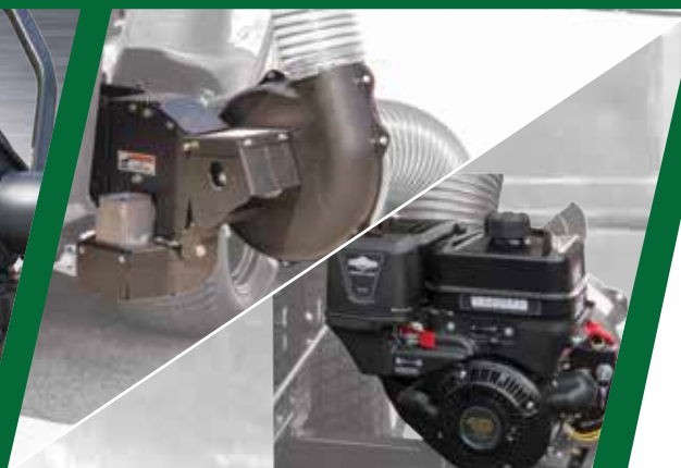
Available with PTO or Engine Drive