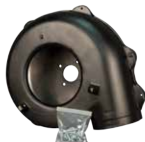
Small Blower Housing PTO Systems E4004A