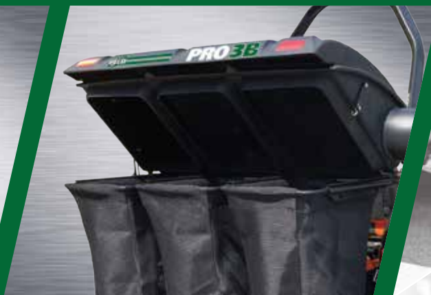
Rugged Linear Low Density Polyethylene Top with 3 Bags