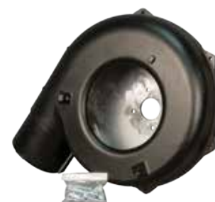
Small Blower Housing E4052A