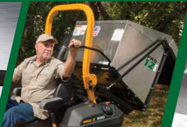
Aluminum Box Dumps From Seat