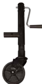
Jack Stand With Wheel