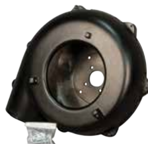
Large Blower Housing E5007A