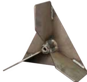
3-Blade Impeller A1839