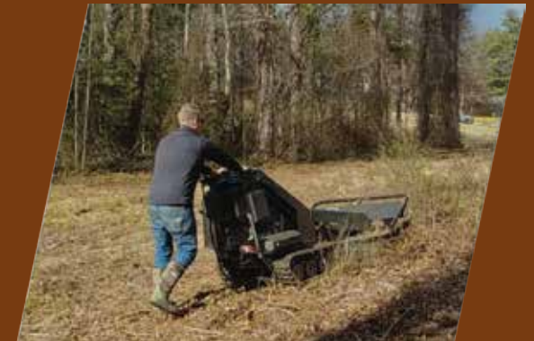
Brush Blazer in Action