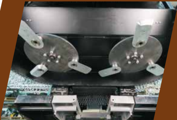
Massive Cutting Blades