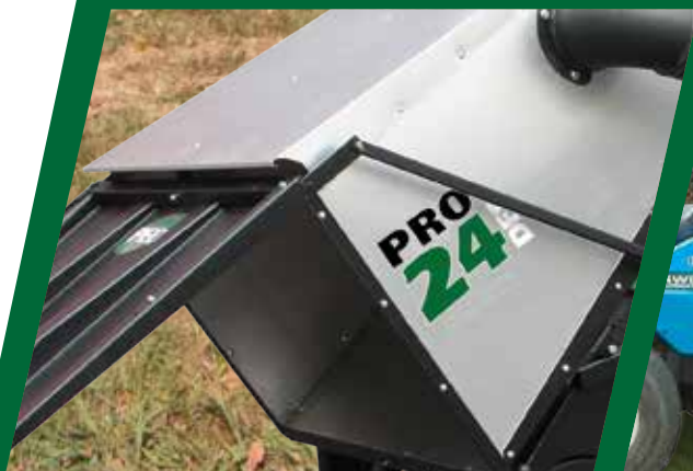
Huge 24 Cubic Foot Box Dumps From Seat

Turn to the PRO24 DFS to match the function and utility of your out-front mower. The huge 24-cubic foot vacuum system is fully mounted, adding less than a foot to the mower's total tail swing. Its exclusive slide frame assembly allows the entire collection box to slide to the rear, allowing full service access on the tractor. All controls are easily reached from the operator's seat, including dumping and throttle control.