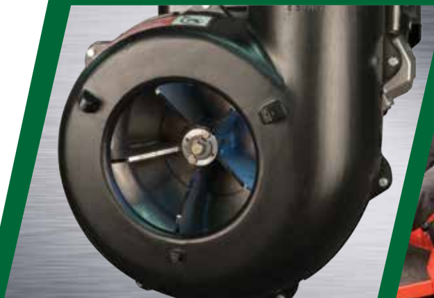
5-Blade Impeller and Large Aluminum Housing

The PRO22 DFS is a unique solution for compact tractors. It is a fully mounted universal collection system that is great for any 2 or 4-wheel drive utility tractor with a category 1 three-point hitch. The aluminum box and cast aluminum components are lightweight and durable. Its huge 22 cubic foot capacity fits decks up to 72". Powered by a gas or optional diesel engine, this is the perfect complement to your tractor.