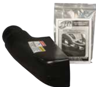
Small Universal Boot Kit A0121