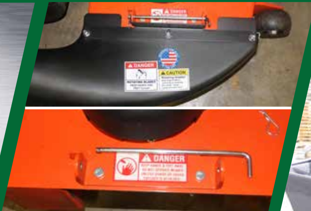
Easy No Tool Removal (Once Installed)