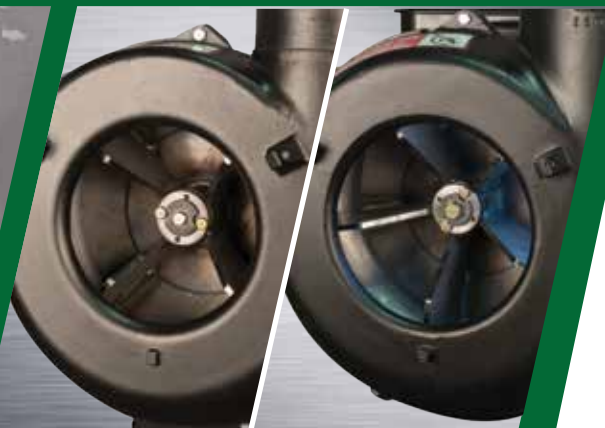
4-Blade Impeller on ES36 P & 5-Blade Impeller on ES50 P