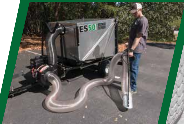
18' Wand Kit Included

The time saving 36 P & 50 P ESTATE SERIES trailers easily lift dried manure, used bedding, and fiber left from grooming, then grind it to a fine mulch for garden use or easy disposal. The large aluminum containers will not rust and are balanced and tapered to empty easily with a single pull of a convenient lever. Both come complete with 18' flex-hose and wand handle.