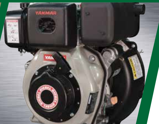
Diesel Option Available