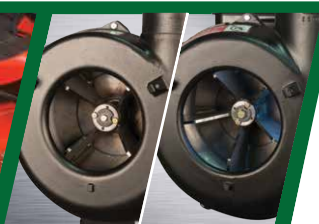
4-Blade Impeller on ES36 &amp; 5-Blade Impeller on ES50