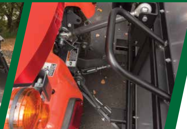
Fits Any Category 1 Three-Point Hitch