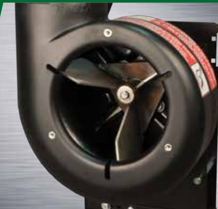
3-Blade Steel Impeller & Cross Linked Polyethylene Blower Housing

Now available on select models: the commercial power of PTO-C or PTO-X.