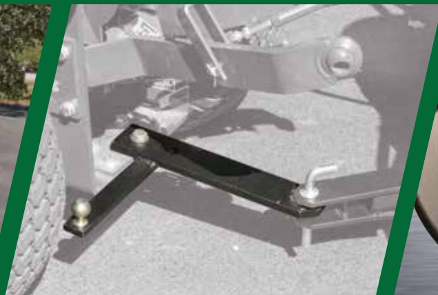
Extra Length Tongue Extender Available for ATV Use