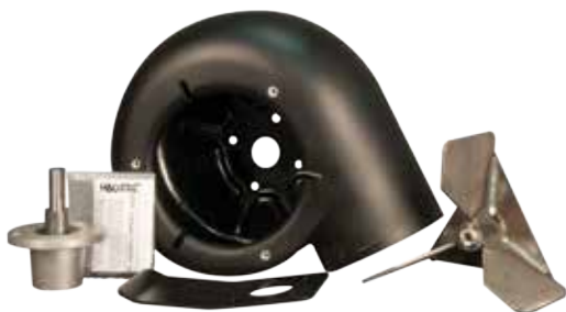
Upgrade Kit: Converts 2-Blade System to 3-Blade A1843