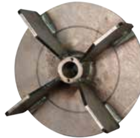
4-Blade Impeller A0645