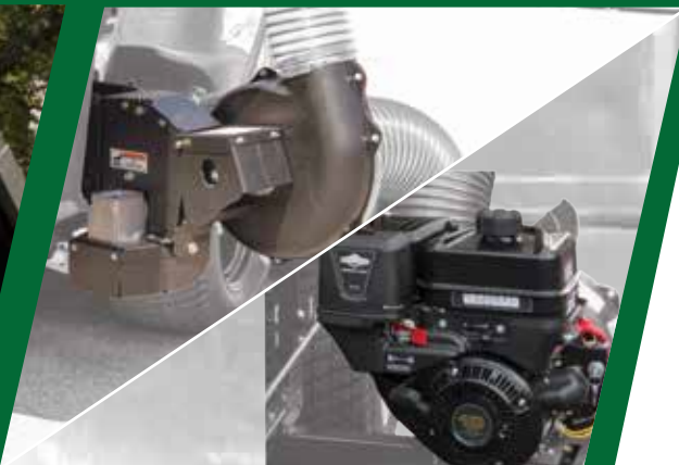
PTO or Engine Drive