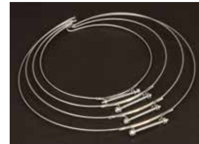
Hose Clamps 6" - 9"