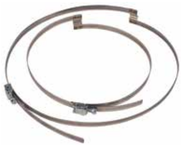
Hose Clamps 6" - 9"