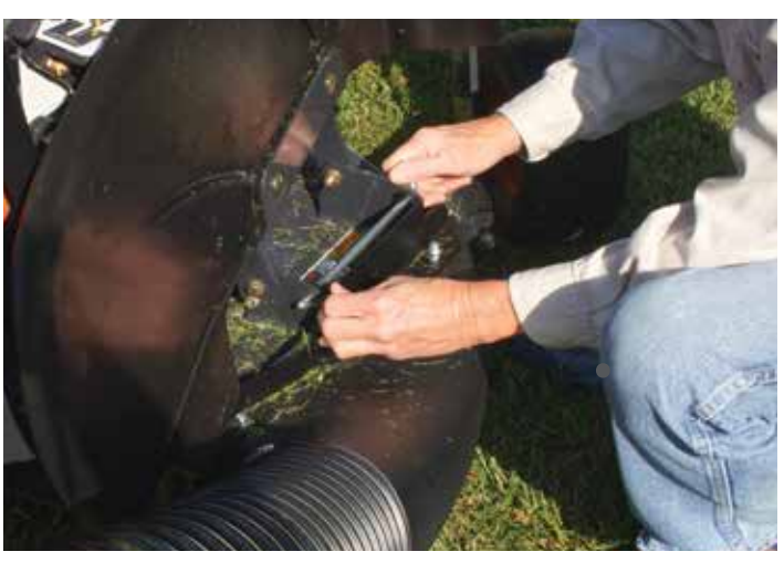
Easy No Tool Removal (Once Installed)