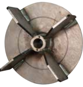
4-Blade Impeller A0645