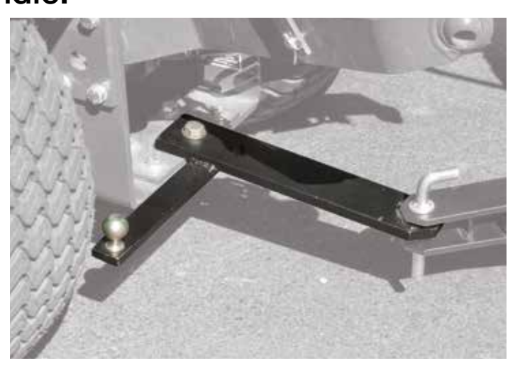
Optional Extra Length Tongue Extender