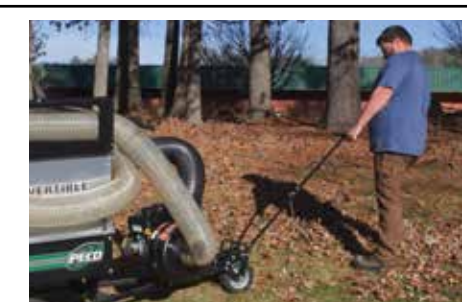
Trailer Tow A2276