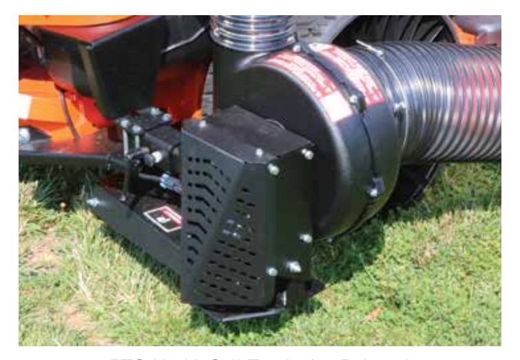
PTO-X with Self-Tensioning Belt and Electric Clutch Engagement