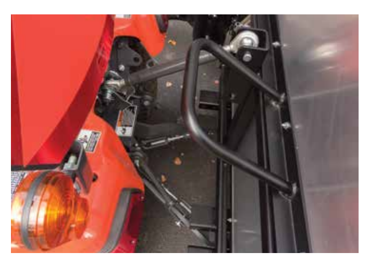
Fits Most Category 1 Three-Point Hitch