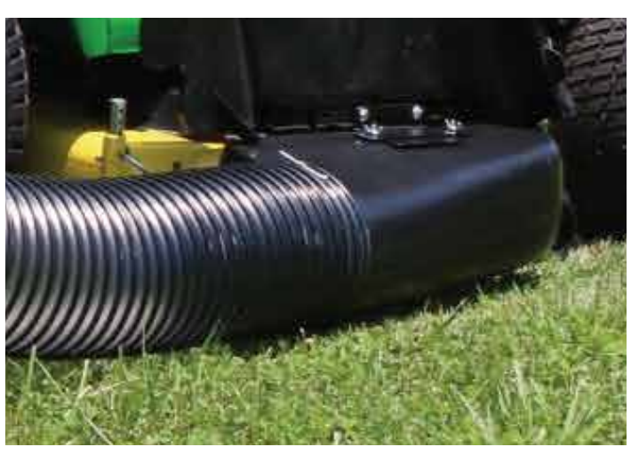
Heavy-Duty Polyethylene Universal Boot