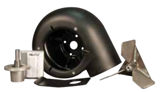
Upgrade Kit: Converts 2-Blade System to 3-Blade A1843