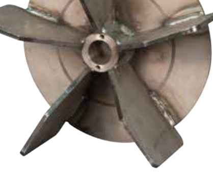
5-Blade Impeller A0644