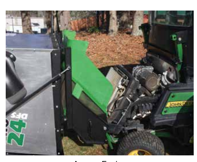
Access Engine Compartment to Mower