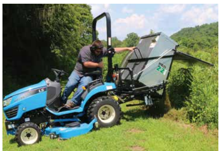
Huge 22 Cubic Foot Capacity Box Dumps From Seat