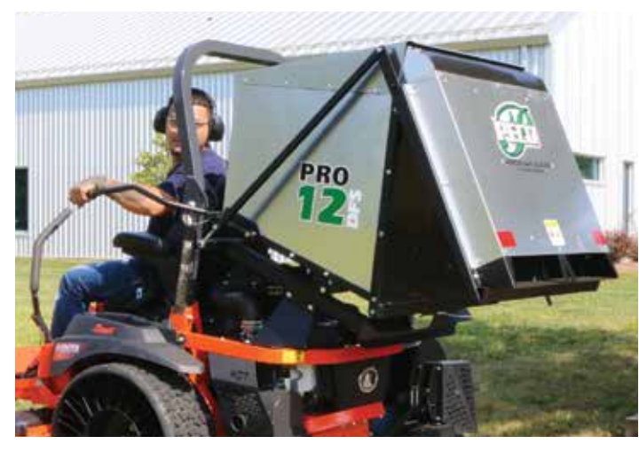
Easy Dump From Seat