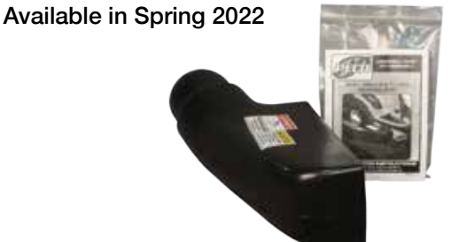
Small Universal Boot Kit A0121 Large Universal Boot Kit A0137