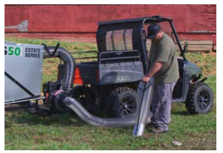
18' Wand Kit Included