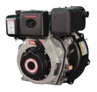
Yanmar 7hp Electric Start Diesel Engine with Blower & Blade A620