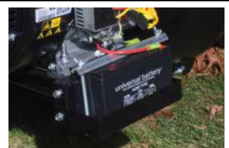
Universal Battery Box Kit A2326