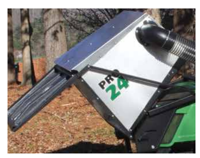
Huge 24 Cubic Foot Box Dumps From Seat (On Non-Cab Models)

Turn to the PRO24 to match the function and utility of your out-front mower. The huge 24-cubic foot vacuum system is fully mounted, adding less than a foot to the mower's total tail swing. Its exclusive pivot frame assembly allows the entire collection box to pivot to the rear, allowing full service access on the tractor.