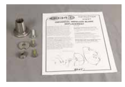
Tapered Bushing Kits