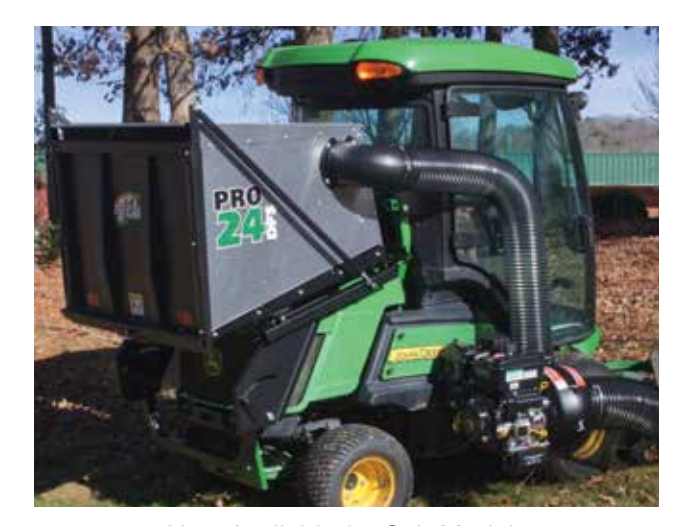
Now Available for Cab Models