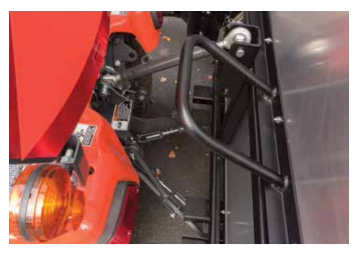
Fits Most Category 1 Three-Point Hitch