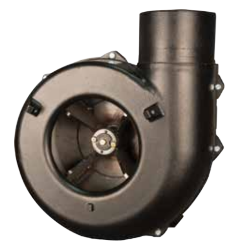
4-Blade Steel Impeller and Cast Aluminum Blower Housing

The PRO12 (Dump From Seat) is a mounted aluminum box designed for one-handed dumping from the operator's seat. The Pro 12<sup>DFS</sup> will increase your productivity, whatever your application. Featuring our patented mid-mounted blower, it has the power to handle today's high output commercial decks.