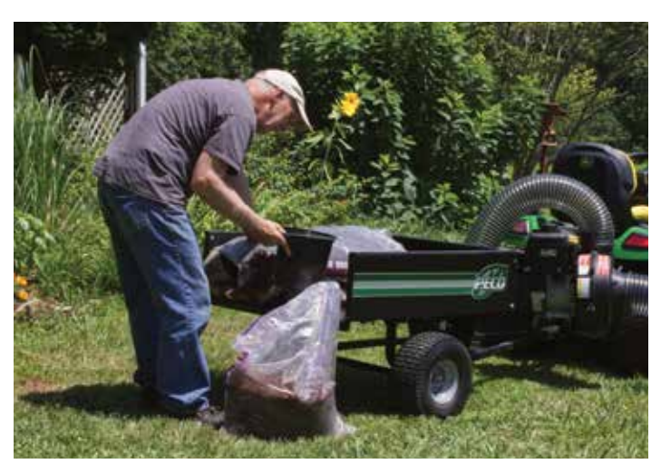
Converts to a Dump Cart in Minutes