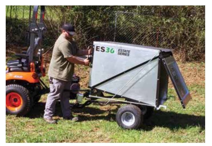
Easy Dump Action