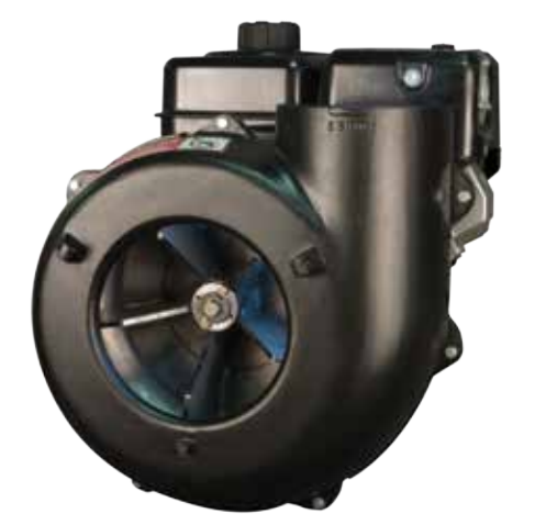
5-Blade Impeller and Large Aluminum Blower Housing on ES50 (4-Blade on ES36)

The 36 & 50 ESTATE SERIES professional grade Trailer Vacs have the capacity to handle compact tractors with mower decks up to 72". Both models are equipped with the Trail-o-Matic hitch, which eliminates stretching or dragging the hose. The tapered aluminum box provides easy dumping with a quick lever pull.