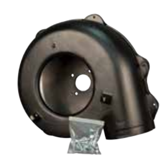
Small Blower Housing PTO Systems E4004A