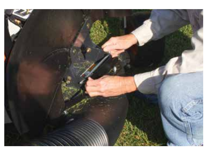
Easy No Tool Removal (Once Installed)