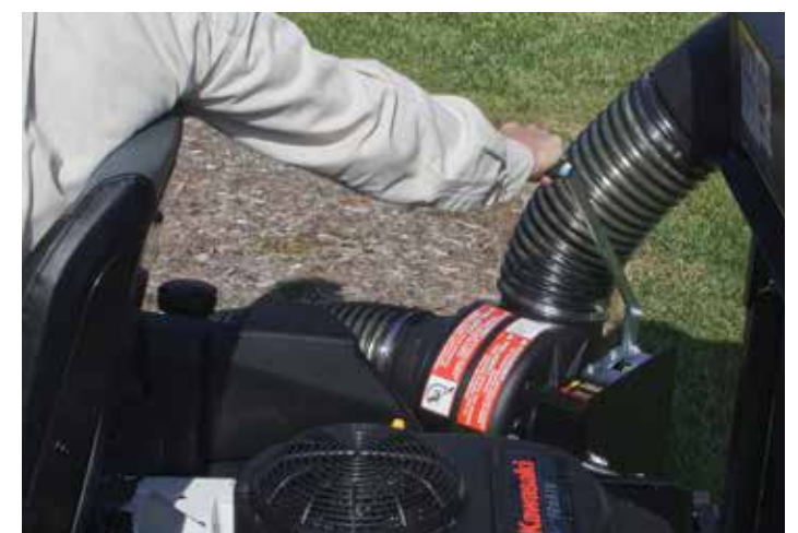
Engage Drive From Operator's Seat