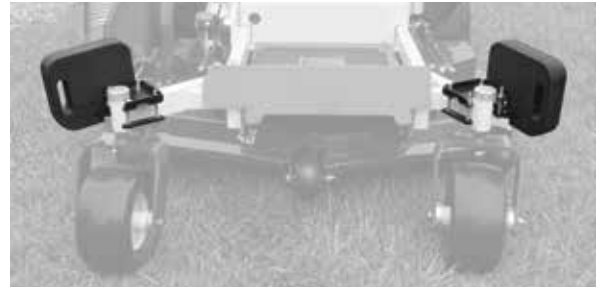
Universal Weight Kit