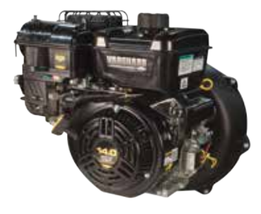
Briggs & Stratton 14hp Vanguard Electric Start Gas Engine with Blower & Blade A615