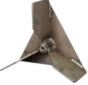
3-Blade Impeller A1839