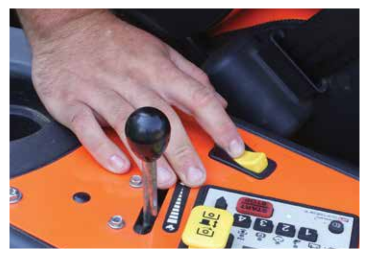
Engage PTO-X Drive From Operator's Seat