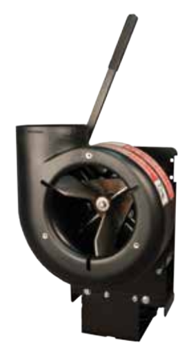
3-Blade Steel Impeller & Cross Linked Polythylene Blower Housing on PTO-R

The PRO2B <sup>+</sup> is the perfect solution for smaller ZTR mowers. The Pro 2B<sup>+</sup> features our PTO-R drive that easily deals with the heavy grass and wet leaves that can plug a weaker collection system. It's powerful, lightweight, and affordable; making it perfect for the homeowner.